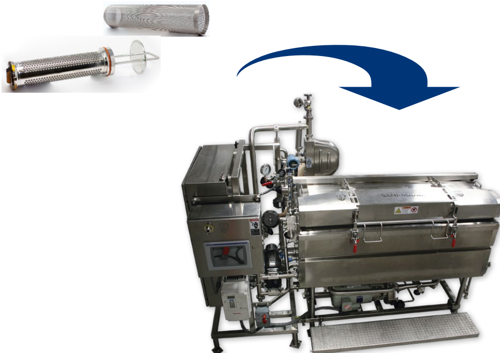
Figure 3: Example Cleaning in COP Immersion Parts Washer

The facilities' Standard Operating Procedures (SOPs) should be followed regarding cleaning chemicals, temperatures, and other key cleaning TACT (Time, Action, Chemical, Temperature) parameters to be used.