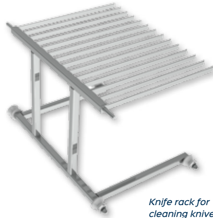
Knife rack for cleaning knives