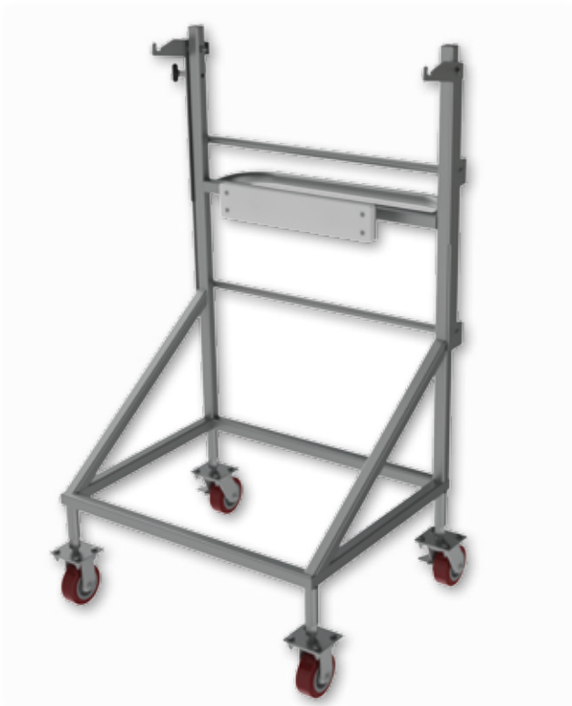
The TactiCab trolley allows operators to safely load and transport the racks

Sani-Matic's TactiCab standard or custom racks provide further efficiencies by optimizing load capacity and accommodating item diversity.